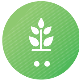
Green Spot 2 GROW