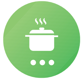
Green Spot 3 COOK

Motivate every member to Start the Green spot journey.