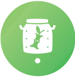
Green Spot 1 COMPOST